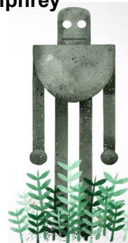
The Wild Robot