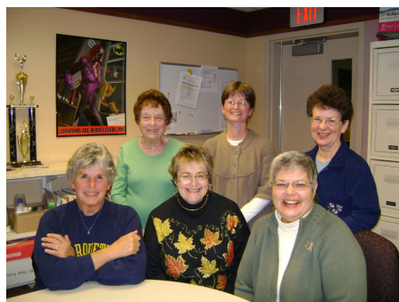
Friends of the Oregon Public Library Board

Knowledge is free at the library. Just bring your own container. - Author Unknown